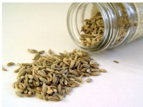
Fig 1.16 Fennel Seeds or Saunf

Fennel Seeds or Saunf : These light green oval shaped seeds have been known to possess digestive qualities. In India, they are roasted, sometimes lightly coated with sugar and eaten after meals as a mouth freshener and to stimulate digestion. They are also recommended for nursing mothers, as they have been known to increase the milk supply. Used successfully in many curries and 'indian pickles'. Today you will find sugar coated "green supari mixtures containing 'saunf' in Indian Grocery stores.