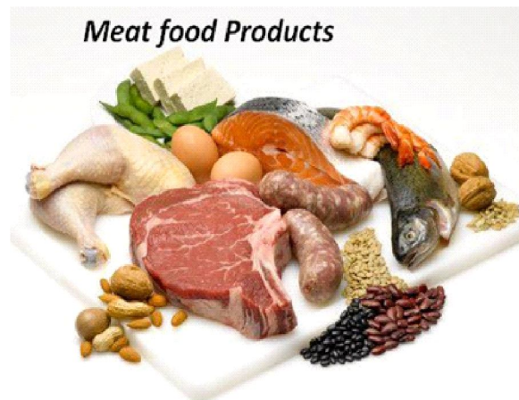
Fig 3.3 Meat Food Products

It regulations for the production of meat products are covered by the Meat Food Products Order, 1973. The Order specifies sanitation and hygiene requirements for slaughter houses and manufacturers of meat products.