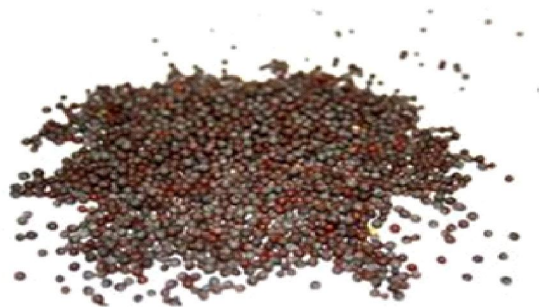
Fig 1.5 Mustard Seeds

Mustard Seeds : Ranging from Reddish brown to black in appearance, this seeds are commonly used in Indian cooking, and even in the preparation of pickles, and other condiments, and sometimes even as curry. The paste made from it has a very pungent taste.