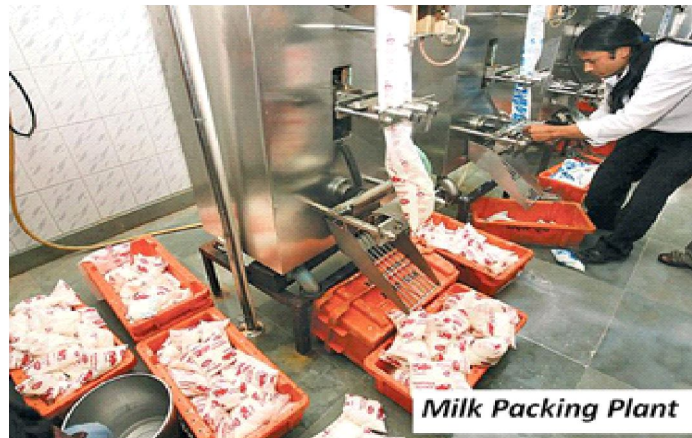
Fig 3.6 Milk Packing Plant

The production, distribution and supply of milk products is controlled by the Milk and Milk Products Order, 1992. The order sets sanitary requirements for dairies, machinery, and premises, and includes quality control, certification, packing, marking and labeling standards for milk and milk products.