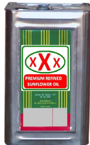
Fig 3.5 Edible Oil Packing