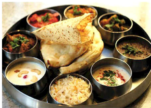
Fig 1.1 Introduction To Indian Food

Historical incidents such as foreign invasions, trade relations and colonialism have also played an important role in introducing certain food types and eating habits to the country. For instance, potato, a staple of North Indian diet was brought to India by the Portuguese. Indian cuisine has also shaped the history of international relations with the spice trade between India and Europe is often cited by historians as the primary catalyst for Europe's Age of Discovery. It has also influenced other cuisines across the world, especially those from South east Asia and the British Isles.