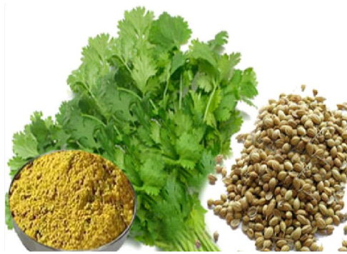
Fig 1.9 Coriander

Coriander : Coriander is an annual herb that is used very widely in Indian kitchen. Different parts of the coriander are edible but the fresh leaves and dried seeds are commonly used in cooking. Chopped coriander leaves are a garnished for cooked dishes while the dry coriander seeds are used whole or as ground form. Coriander roots are used in various soups as it has intense flavour.