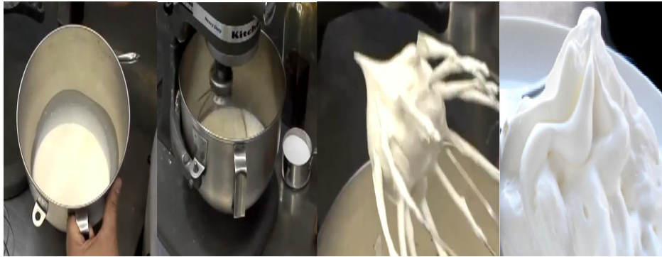
Fig. 4.14 Whipped cream icing