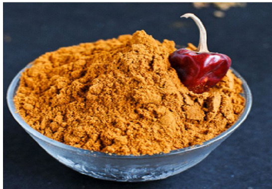
Fig 1.17 Masala Mix Used