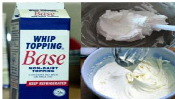
Fig. 4.15 Whipping

This is the standard industry icing that is used on commercial cakes and ice cream cakes today. Place the mixture in a large bowl and whip with electric blender the required whipping consistency.