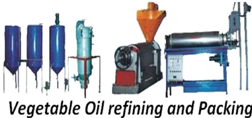
Vegetable Oil refining and Packing