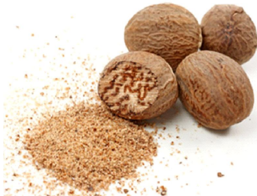
Fig 1.12 Nutmeg or Jaiphal

Nutmeg or Jaiphal: It is usually used in its powdered form. Grated freshly, using the whole or half nutmeg with a very fine grater. Many times it is used in flavoring Indian sweets. But it may be used in savory dishes as it is used in the making of some Garam Masalas. It is recommended for insomnia, irritability and nervousness.