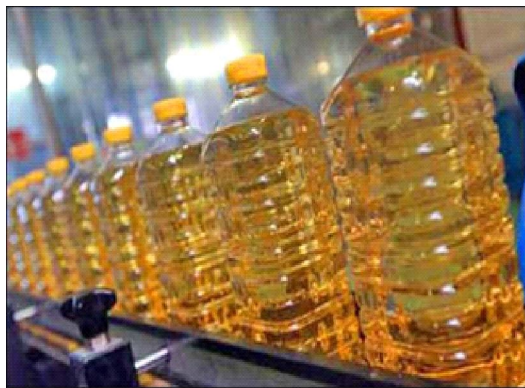
Edible Oils Packaging