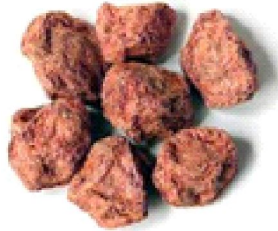
Fig 1.6 Asafetida or Hing

Asafetida or Hing: It is the dried gum resin of an east Indian plant. It should never be eaten raw, as it has a completely pungent taste and odour when raw. Only when it has been dried over a long period of time, does it become fit for use in dishes. Usually just a pinch is used for cooking mainly fish, vegetables and making Indian pickles.