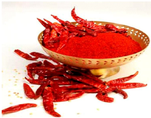
Fig 1.4 Red Chili Powder or Lal Mirch Powder

Red Chili Powder or Lal Mirch Powder : A native of the America, chillis have become so much a part of Indian households, that they are no more associated with the Latin American countries. Red chili powder holds its spiciness on the kind of red chili used.