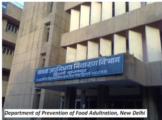
Fig 3.1 Department of Prevention of Food Adultration, New Delhi

A basic statute protects India against impure, unsafe, and fraudulently labeled foods. The PFA standards and regulations apply equally to domestic and imported products and cover various aspects of food processing and distribution. These include food colour, preservatives, pesticide residues, packaging and labeling, and regulation of sales.