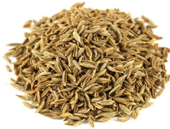
Fig 1.3 Cumin Seeds or Jeera