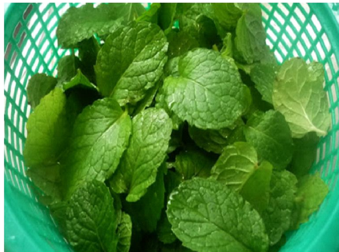
Fig 1.14 Fresh Mint Leaves or Pudina

Fresh Mint Leaves or Pudina : Although there are many varieties, the common, round-leaved mint or peppermint leaf is the one most often used in cooking. It adds flavor to many curries, and mint chutney is a favorite accompaniment to kebabs and a great dipping sauce for snacks.