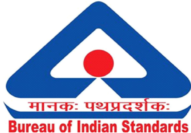
Fig 3.8 Bureau of Indian Standards

The activities of BIS are two fold the formulation of Indian standards in the processed foods sector and the implementation of standards through promotion and through voluntary and third party certification systems. BIS has on record, standards for most of processed foods. In general, these standards cover raw materials permitted and their quality parameters; hygienic conditions under which products are manufactured and packaging and labeling requirements. Manufacturers complying with standards laid down by the BIS can obtain and “ISI” mark that can be exhibited on product packages. BIS has identified certain items like food colours/additives, vanaspati, and containers for packing, milk powder and condensed milk, for compulsory certification.