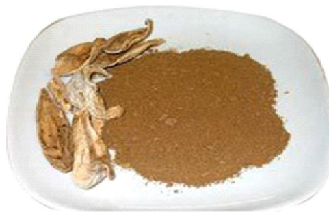
Fig 1.8 Dry Mango Powder or Aamchur