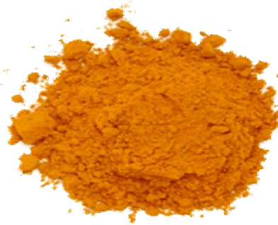
Fig 1.2 Turmeric or Haldi Powder

Turmeric or Haldi Powder : Native to tropical South Asia, when mixed with a little red chilli powder, turmeric adds a distinct flavour and colour to the dishes. This powder is made from grinding turmeric root. Turmeric is well known as an antioxidant and cure for cough, cold and even cancer.