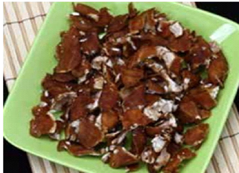
Fig 1.7 Tamarind

Tamarind : Tamarind is found in bean like structure used mainly to add a sour taste to many Indian curries.