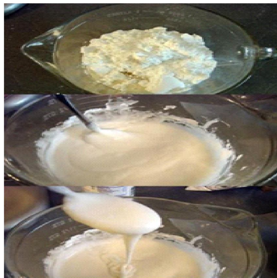
Fig. 4.16 Glace Icing recipe