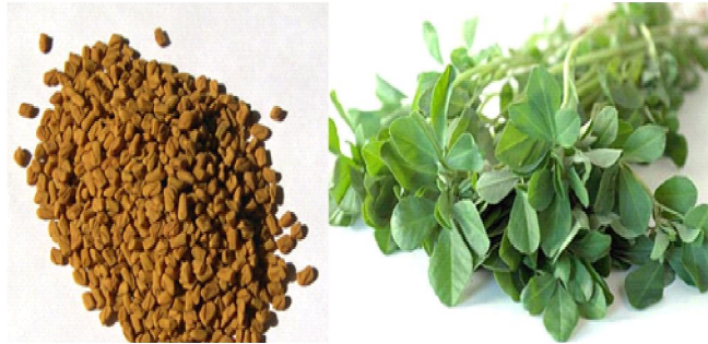
Fig 1.11 Fenugreek Seeds or Methi Seeds

in fish curries, where the whole seeds are gently filed at the start of cooking; they are also ground and added to curry powders; The green leaves are used in Indian cooking and, when spiced, the bitter taste is quite piquant and acceptable. The plant is easy to grow.