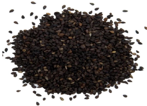
Fig 1.13 Sesame Seeds or Til

Fresh Mint Leaves or Pudina : Although there are many varieties, the common, round-leaved mint or peppermint leaf is the one most often used in cooking. It adds flavor to many curries, and mint chutney is a favorite accompaniment to kebabs and a great dipping sauce for snacks.