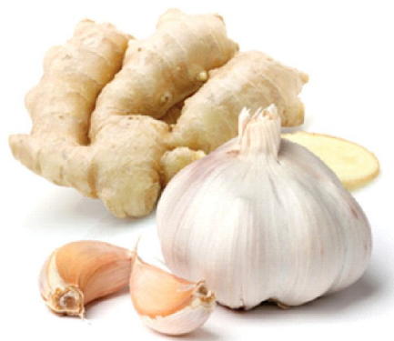
Fig 1.10 Garlic and Ginger

Garlic and Ginger : A combined paste of ginger and garlic adds a zing to all kinds of Indian dishes. Garlic and ginger are known for their anti oxidant properties and also used in various herbal preparations.