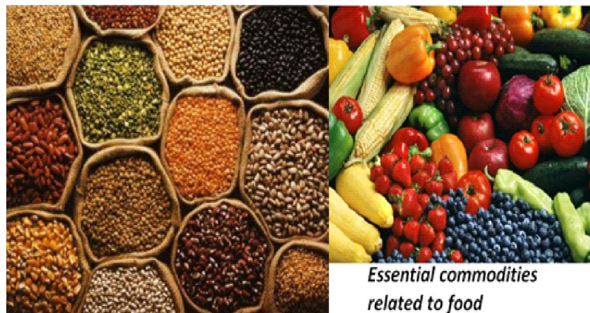
Fig 3.7 Essential Commodities Related to Food

The main objective of the Act is to regulate the manufacture, commerce, and distribution of essential commodities, including food. A number of Control Orders have been promulgated under the provisions of this Act.