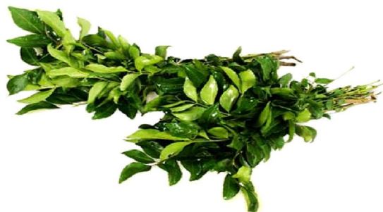
Fig 1.15 Curry Leaves or Kaddipatta